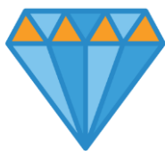
Quality of Urban Living