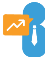
Urban Work Life