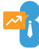
Urban Work Life