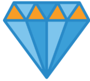
Quality of Urban Living