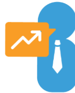
Urban Work Life