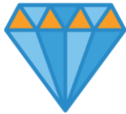
Quality of Urban Living