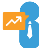
Urban Work Life