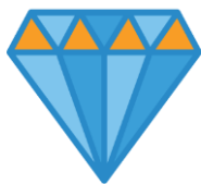
Quality of Urban Living