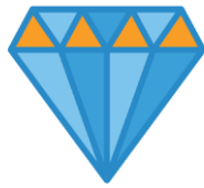
Quality of Urban Living