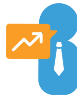
Urban Work Life