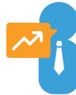
Urban Work Life