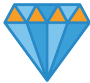
Quality of Urban Living