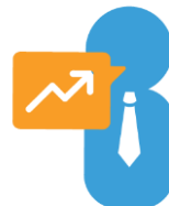
Urban Work Life