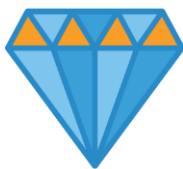
Quality of Urban Living