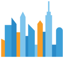
The Best and Worst Cities