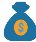
Finance & Housing