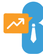
Urban Work Life