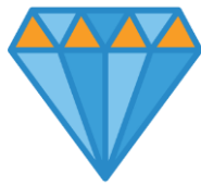
Quality of Urban Living